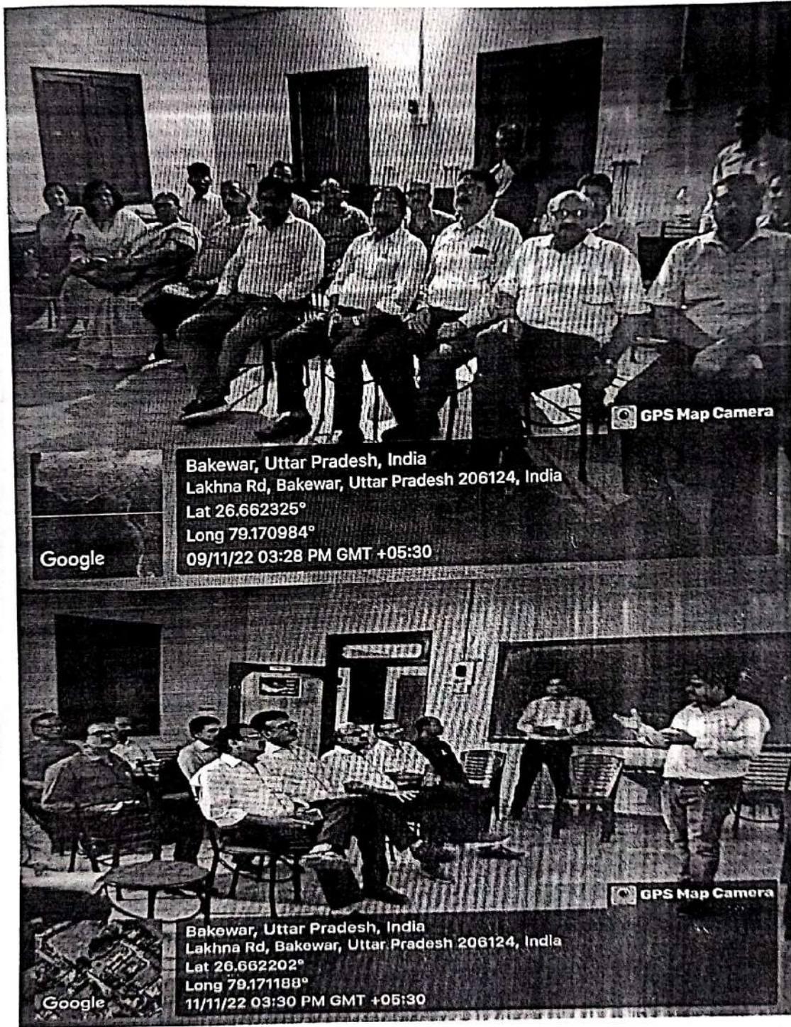
Photo- One week Faculty Development Program on "Microsoft PowerPoint Skills" for Academic Session: 2022-23